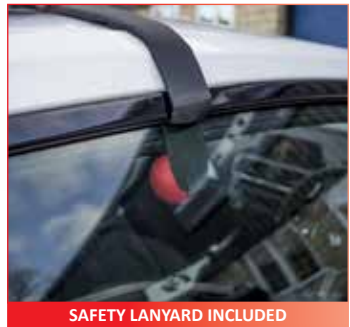
SAFETY LANYARD INCLUDED