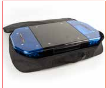
CARRY BAG INCLUDED (MAG ONLY)