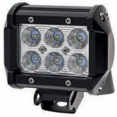
Model shown: SB04

Our range of straight and curved LED work light bars are manufactured with ultra-bright 3W LEDs giving an impressive working light that can be angled to your exact requirement. Available in 6 different lengths, the SB & BB work light bars provide a large, well illuminated working area.