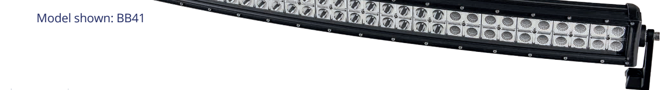
Model shown: BB41