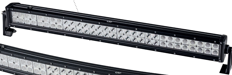
Model shown: SB31